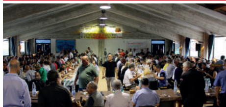
The Community in Dialogue: Young men and women are looking for life