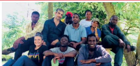
“Mediterránea”: Project of Systemic Change of the Vincentian Family