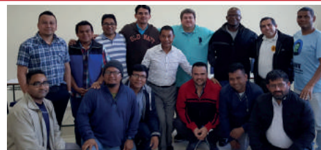
Formation of Formators – CLAPVI - Curitiba 2018