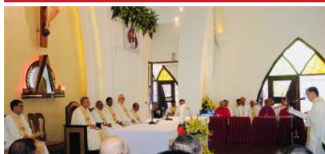
Formation of the Province of Vietnam