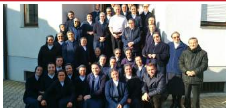
Visit of the Superior General in Kosovo and Albania