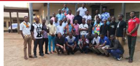
The Hopes & Promises of the Vice-Province of Cameroon!